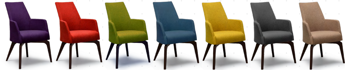
Violet Fabric KLE