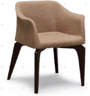
Beige Fabric KLA