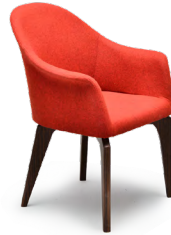
Brick Fabric KLC