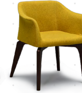
Yellow Fabric KLB