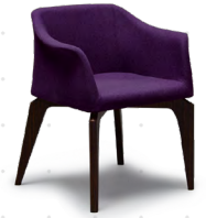
Violet Fabric KLE