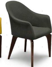
Anthracite Fabric KLE