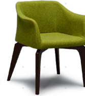
Green Fabric KLD