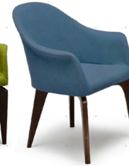
Blue Fabric KLG