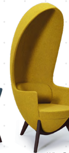
Yellow Fabric KLB