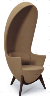
Beige Fabric KLA