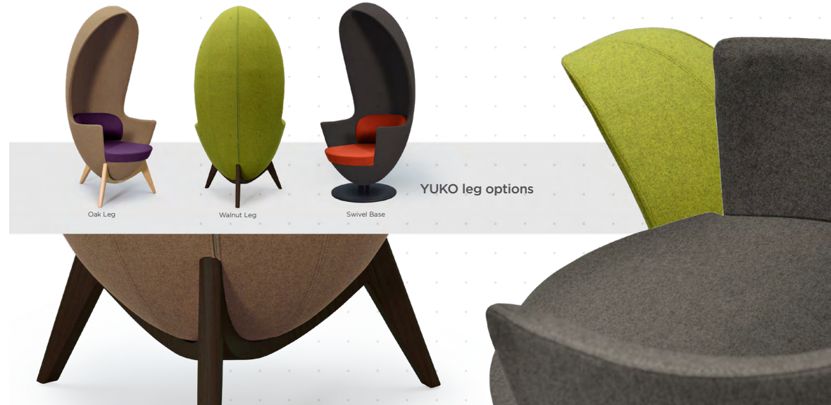
YUKO leg options