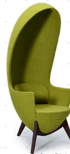
Green Fabric KLD