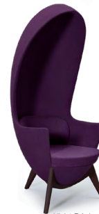
Violet Fabric KLE