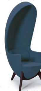
Blue Fabric KLG