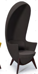
Anthracite Fabric KLF