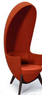
Brick Fabric KLC